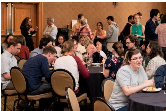
Student Meet and Greet