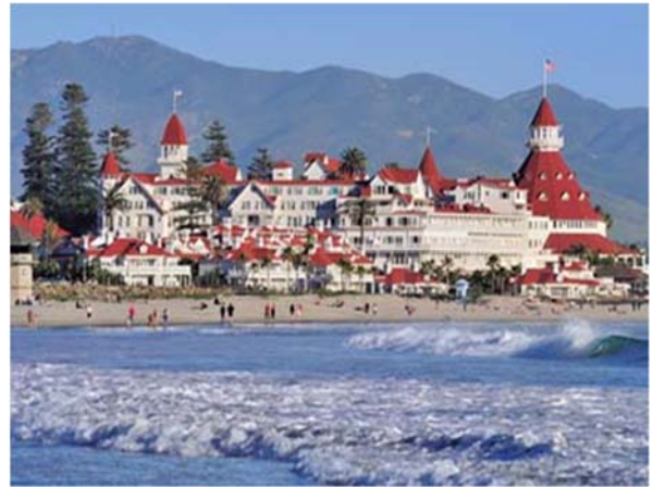
Hotel Del.

A block of guest rooms at discounted rates has been reserved for meeting participants at the Hotel del Coronado. Early reservations are strongly recommended. Special ASA meeting rates are not guaranteed after Friday, 8 November 2019 at 11:59 PST